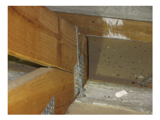
Single wrap Roof To Wall Attachment