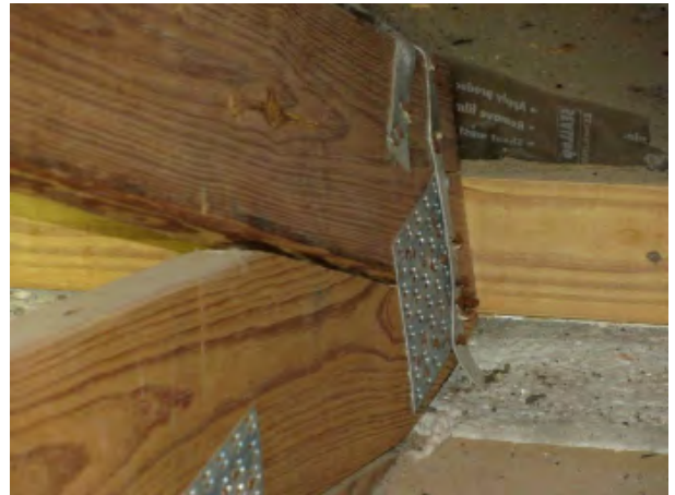
Double wraps Roof To Wall Attachment