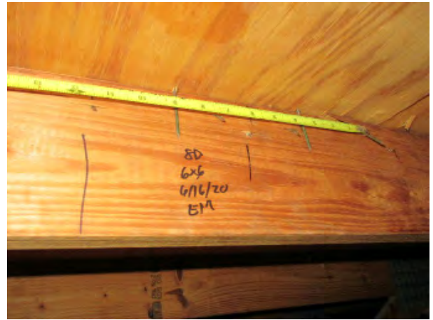
8d nails 6x6 Roof Deck Attachment