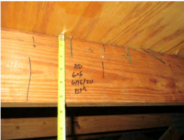
8d nails 6x6 Roof Deck Attachment