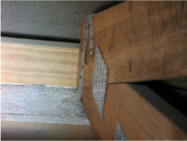
Double wrap Roof To Wall Attachment