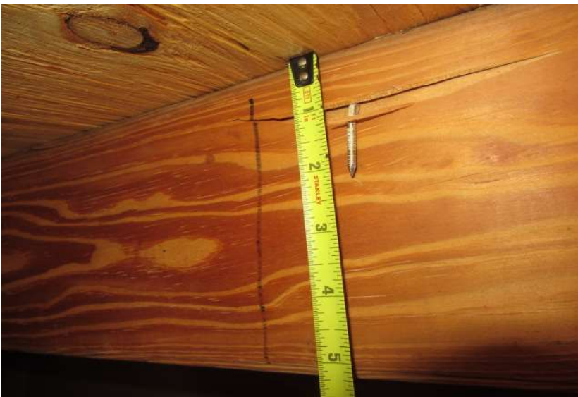
8d nails verified