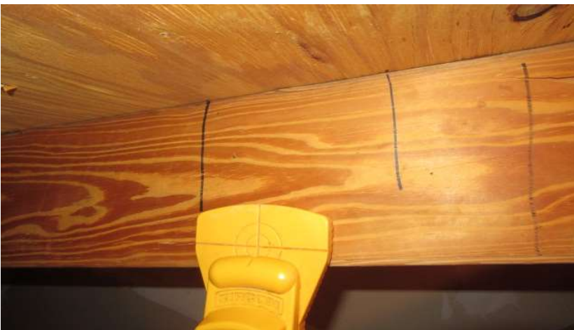
Nail location verified