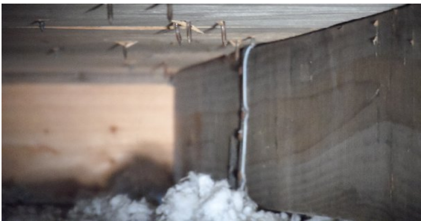
Single wrap with at least 2 nails on the embedded side and 1 nail on the wrapped side