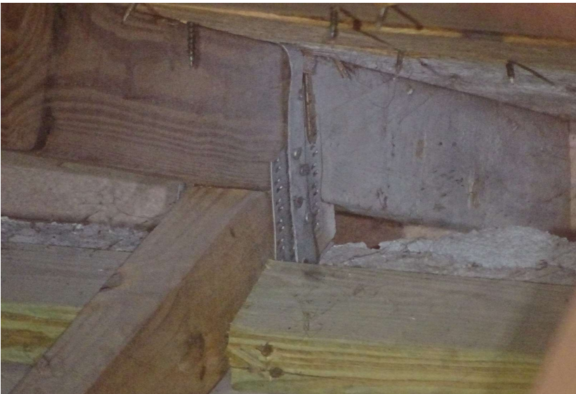
Single wrap with at least 2 nails on the embedded side and at least 1 nail on the wrapped side