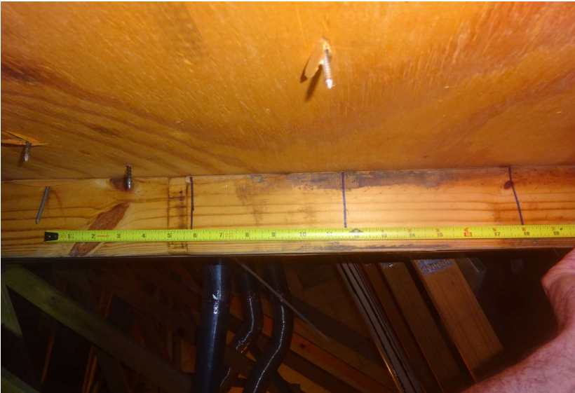
6" spacing in the field