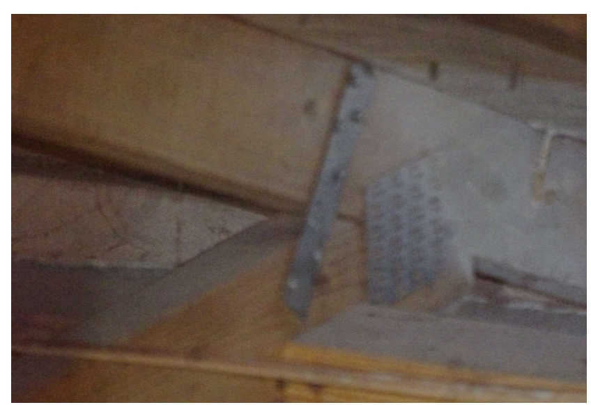
Single wrap with at least 2 nails on the embedded side and at least 1 nail on the wrapped side