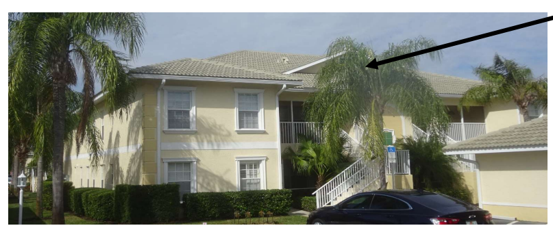
Gable roof shape, 56 In ft total Balance of roof is Hip Gable % = Gable In ft / Total In ft = 56 / 416 = 13%