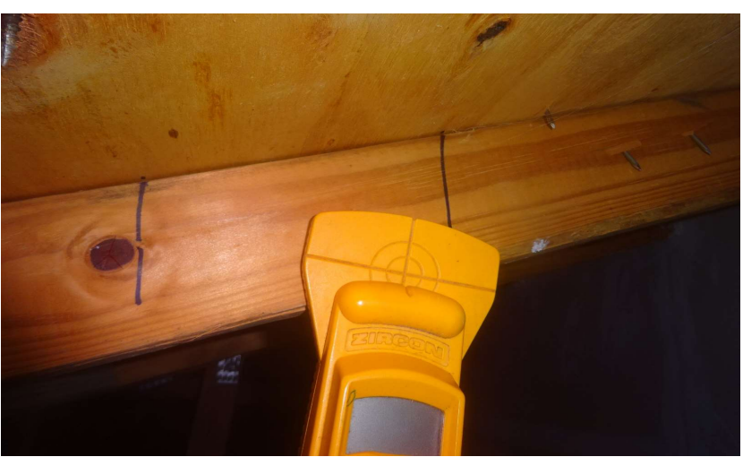
Nail location verified