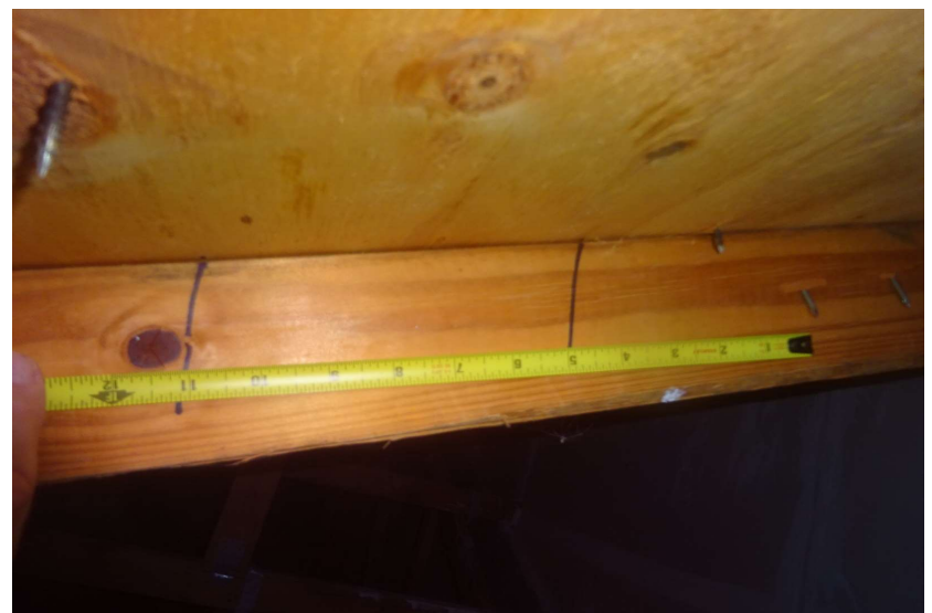
6" spacing in the field