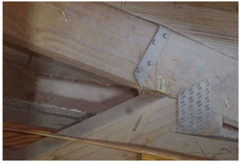
Single wrap with at least 2 nails on the embedded side and at least 1 nail on the wrapped side