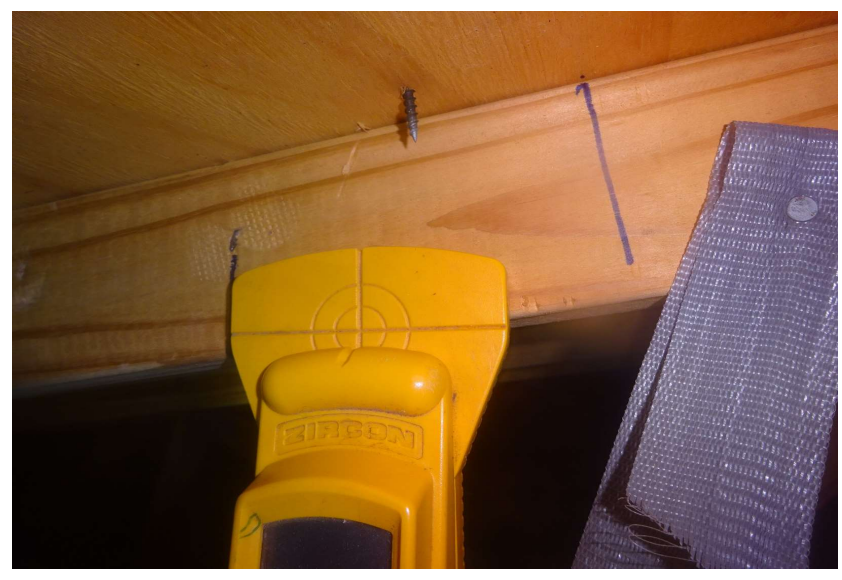
Nail location verified