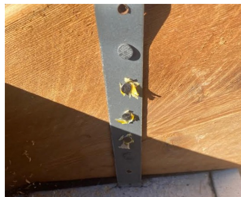
Clip RTW Connection