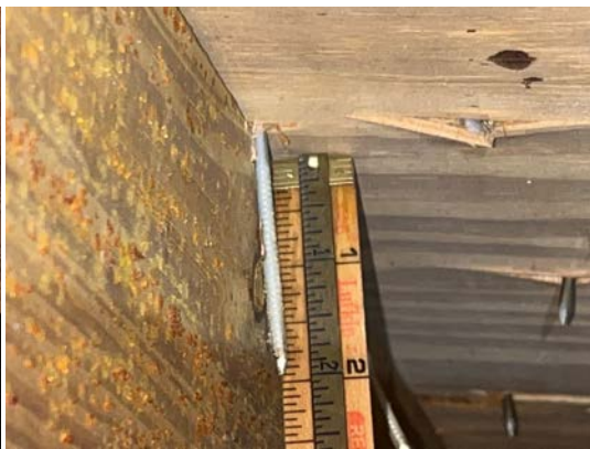
8D Nails Observed