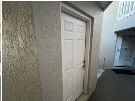
Impact Rated Door(s)