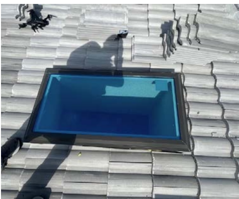
Impact Rated Skylight(s)