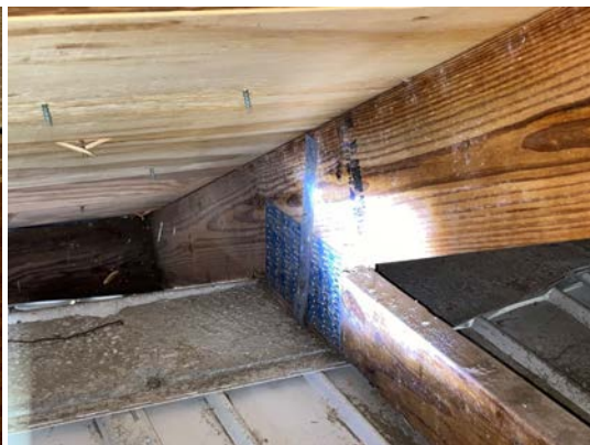
Clip RTW Connection