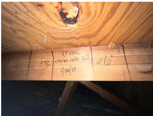
8D Nails Observed