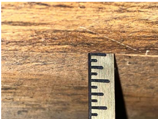
15/32" Roof Decking