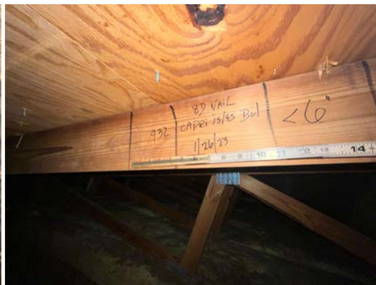
< 6" Nail Spacing