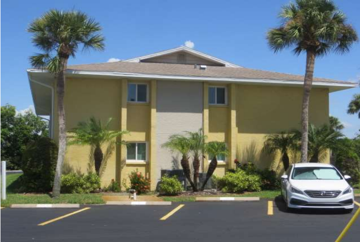
Lyons Cove B