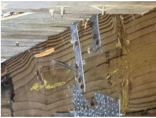
Roof to Wall:Wraps with 3+ Nails