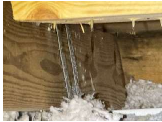
Roof to Wall:Wraps with 3+ Nails