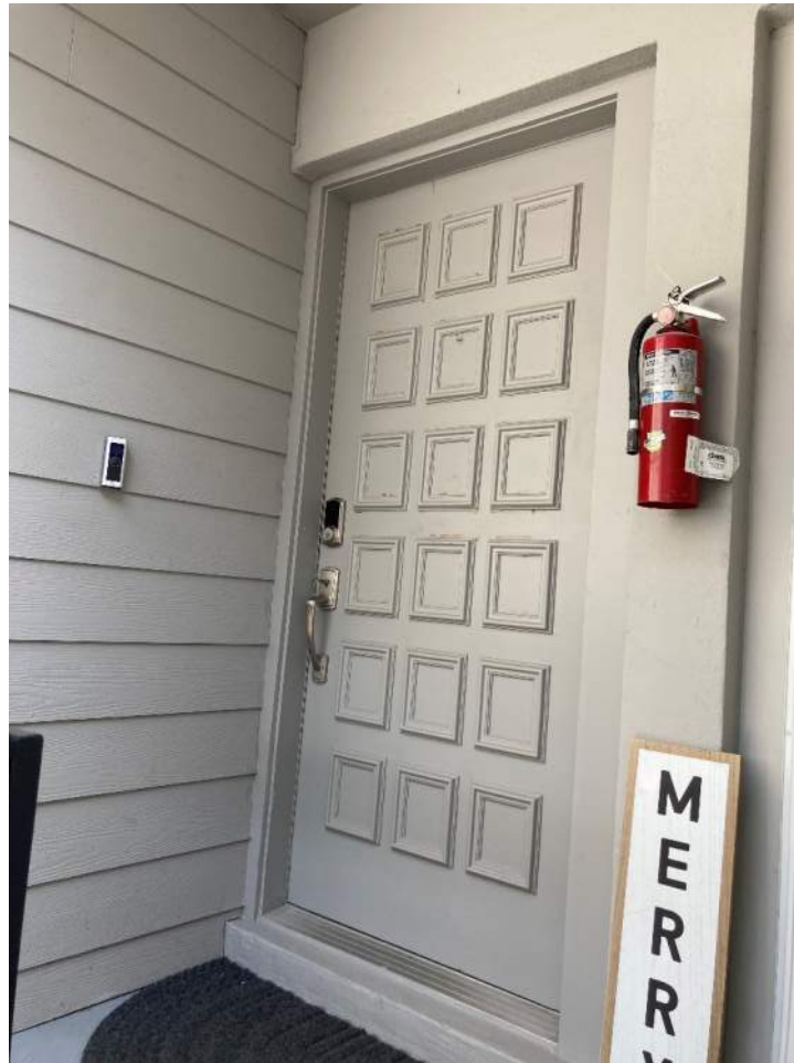
Figure 7: Entry Door