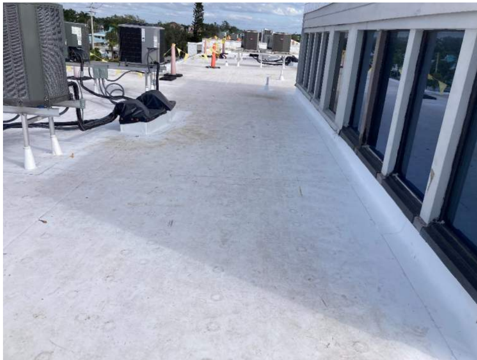
Figure 2 – TPO Roofing System