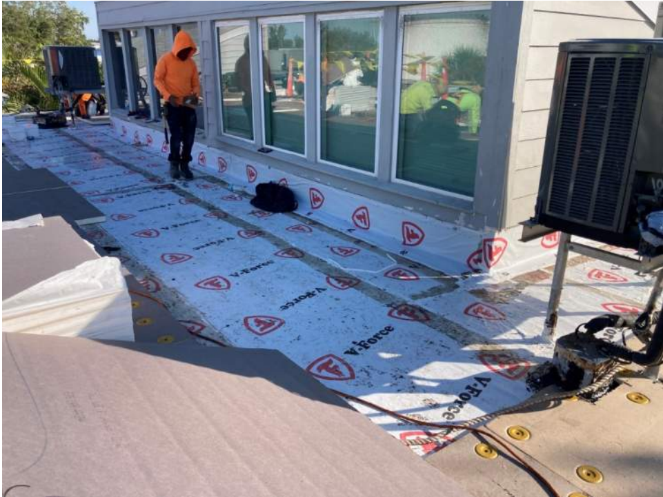
Figure 5 – Secondary Water Resistance - Yes