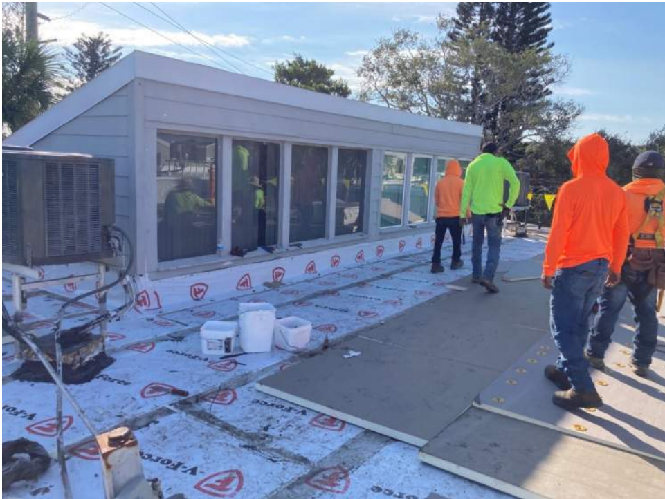
Figure 6: Windows