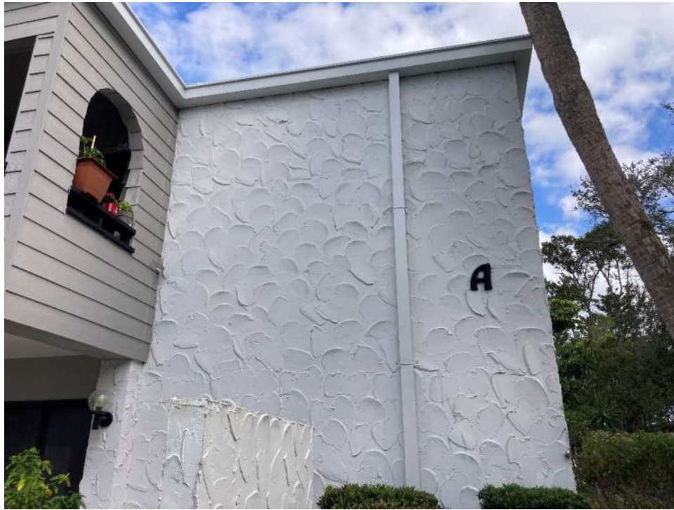
Figure 1 – Building A