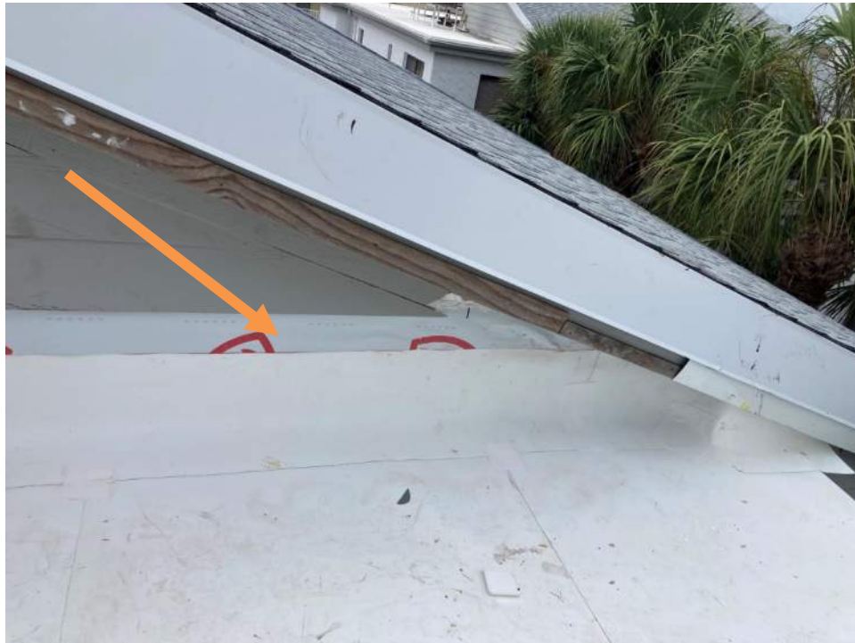
Figure 5 – Secondary Water Resistance - Yes