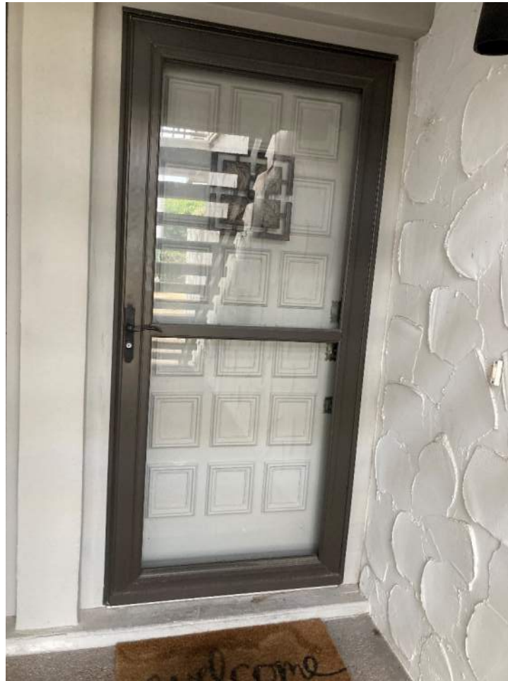
Figure 7: Entry Door