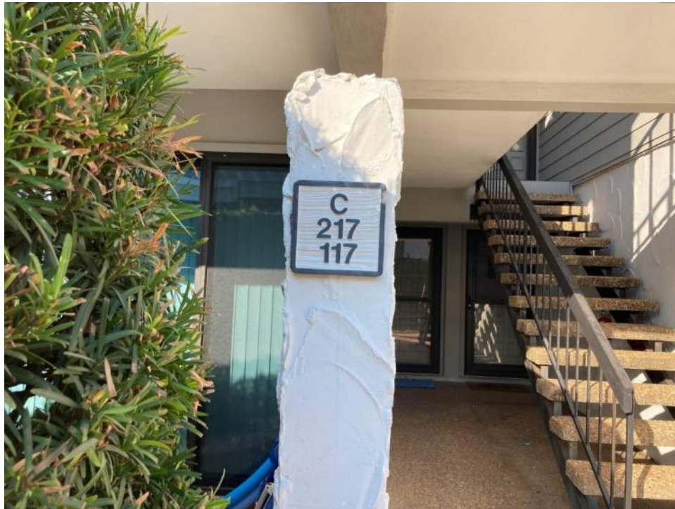
Figure 1 – Building C