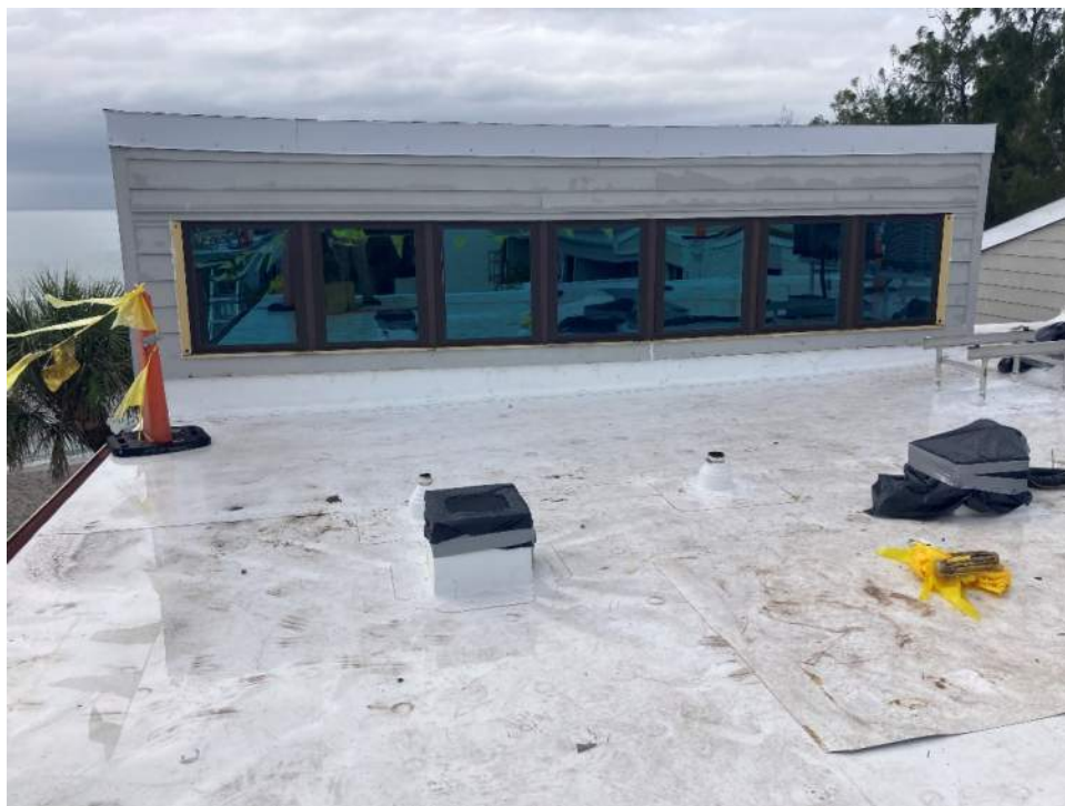
Figure 6: Windows