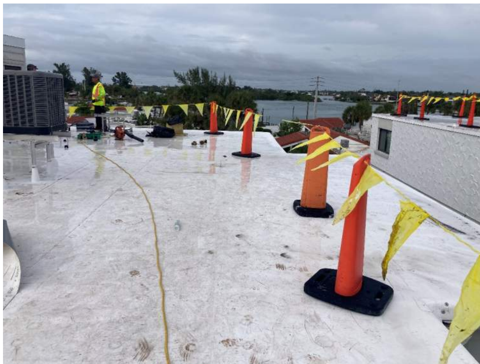
Figure 2 – TPO Roofing System