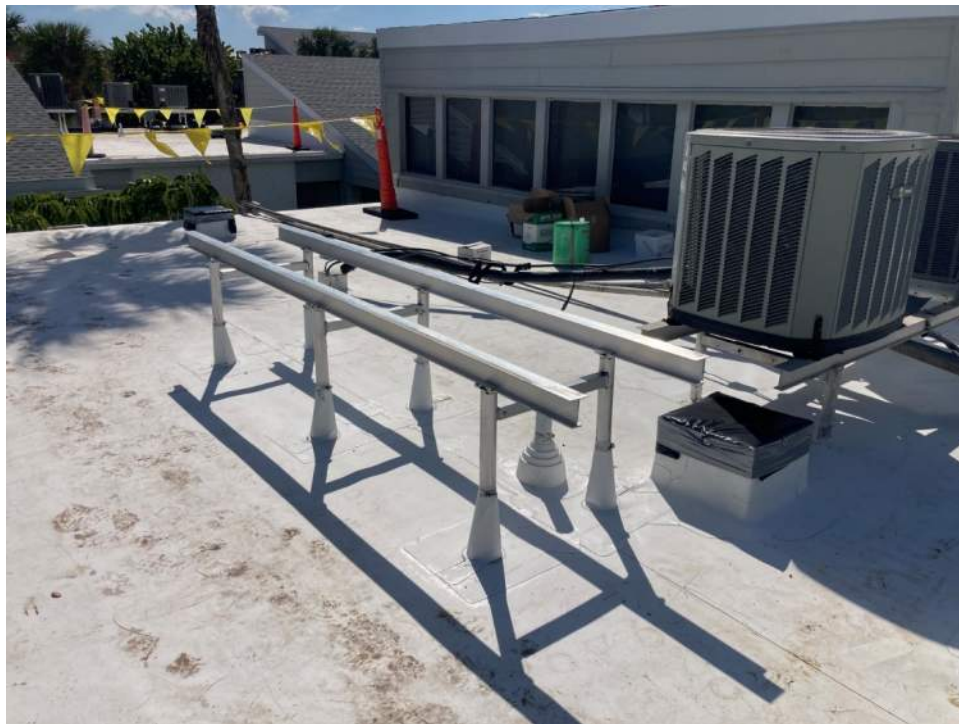
Figure 2 – TPO Roofing System