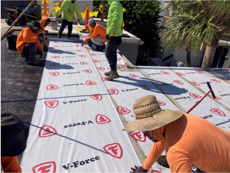
Figure 5 – Secondary Water Resistance - Yes