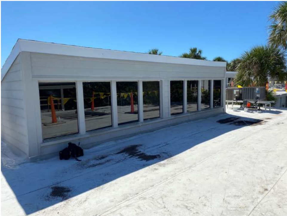
Figure 6: Windows