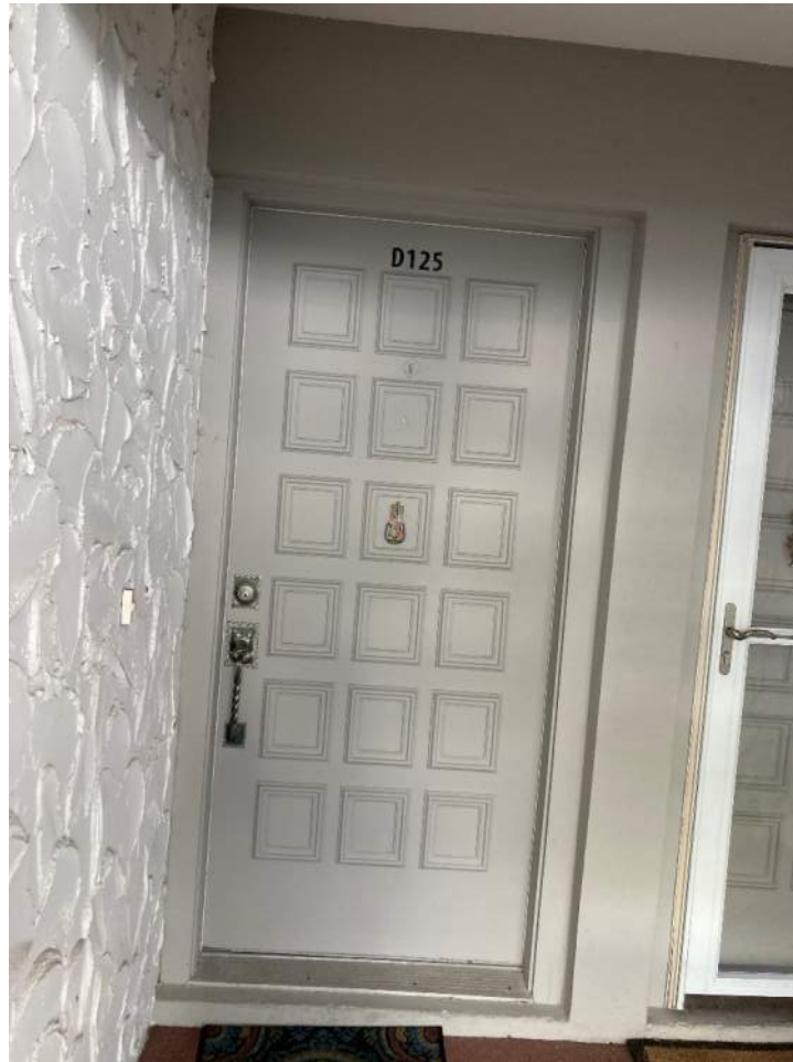
Figure 7: Entry Door