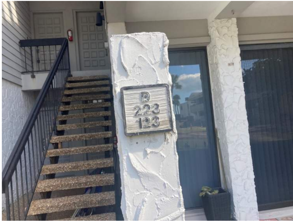
Figure 1 – Building D