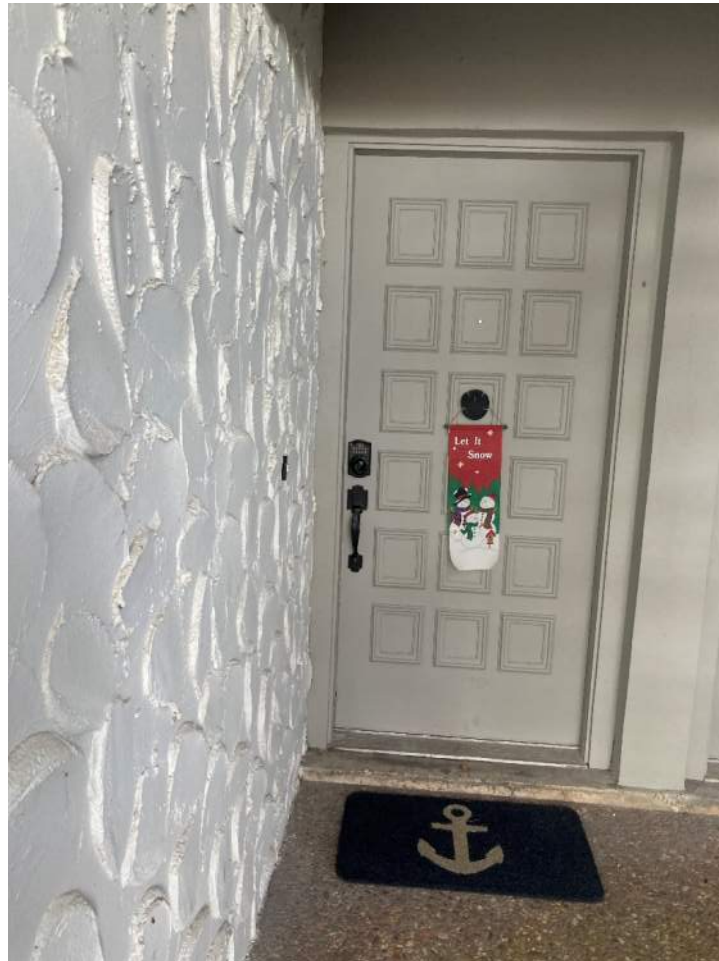
Figure 7: Entry Door