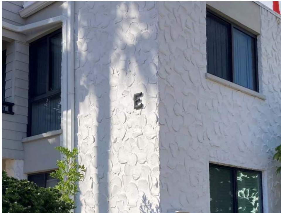
Figure 1 – Building E