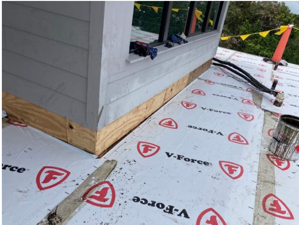
Figure 5 – Secondary Water Resistance - Yes