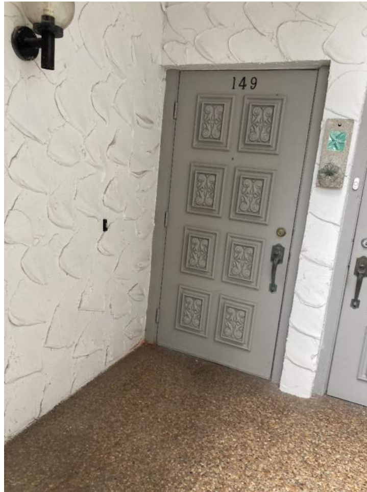
Figure 7: Entry Door