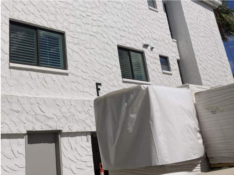
Figure 1 – Building F