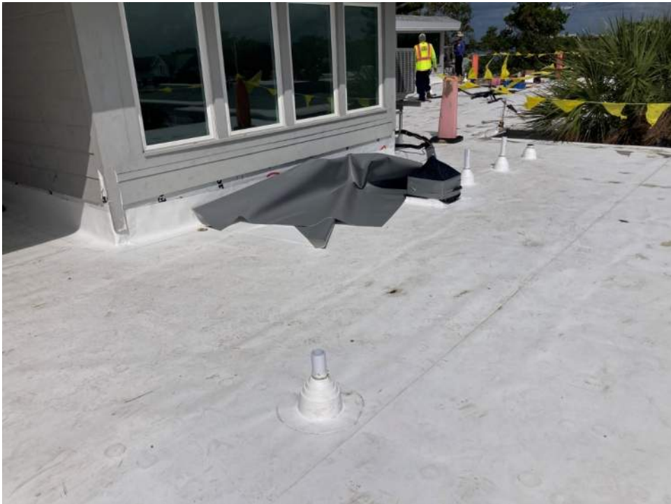
Figure 2 – TPO Roofing System