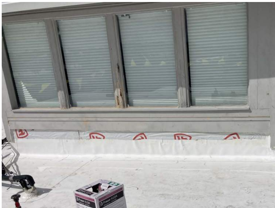
Figure 6: Windows