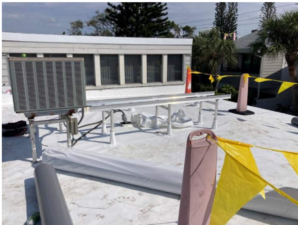
Figure 2 – TPO Roofing System