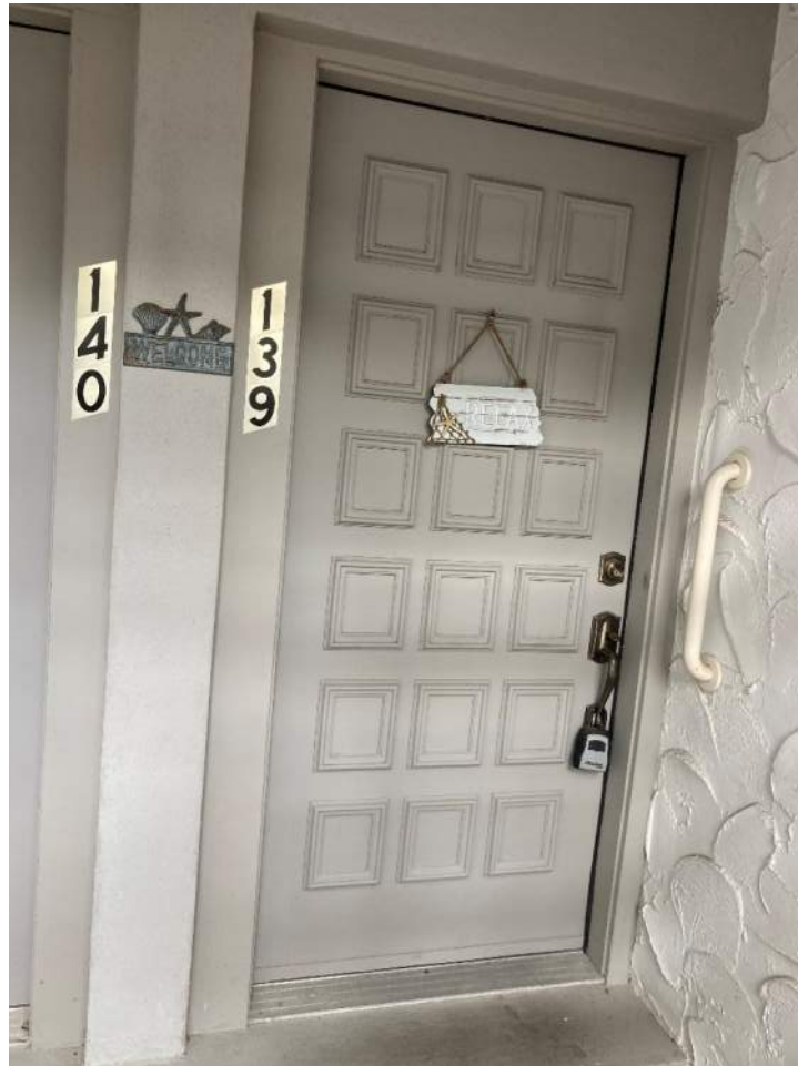
Figure 7: Entry Door