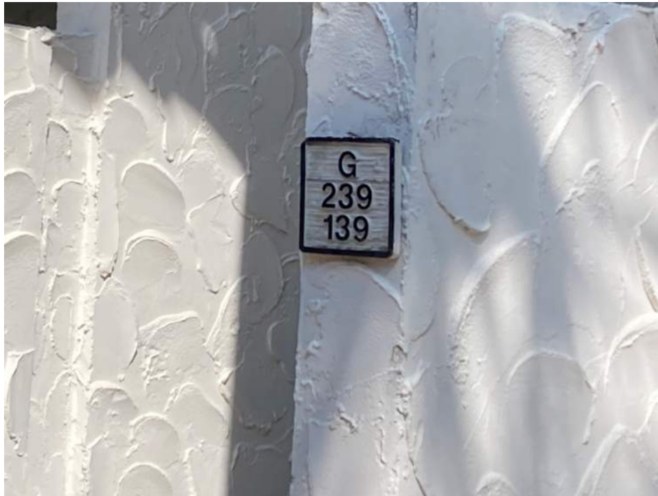
Figure 1 – Building G