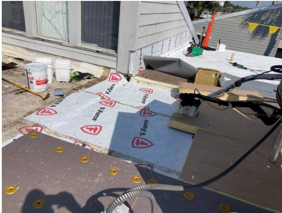
Figure 5 – Secondary Water Resistance - Yes