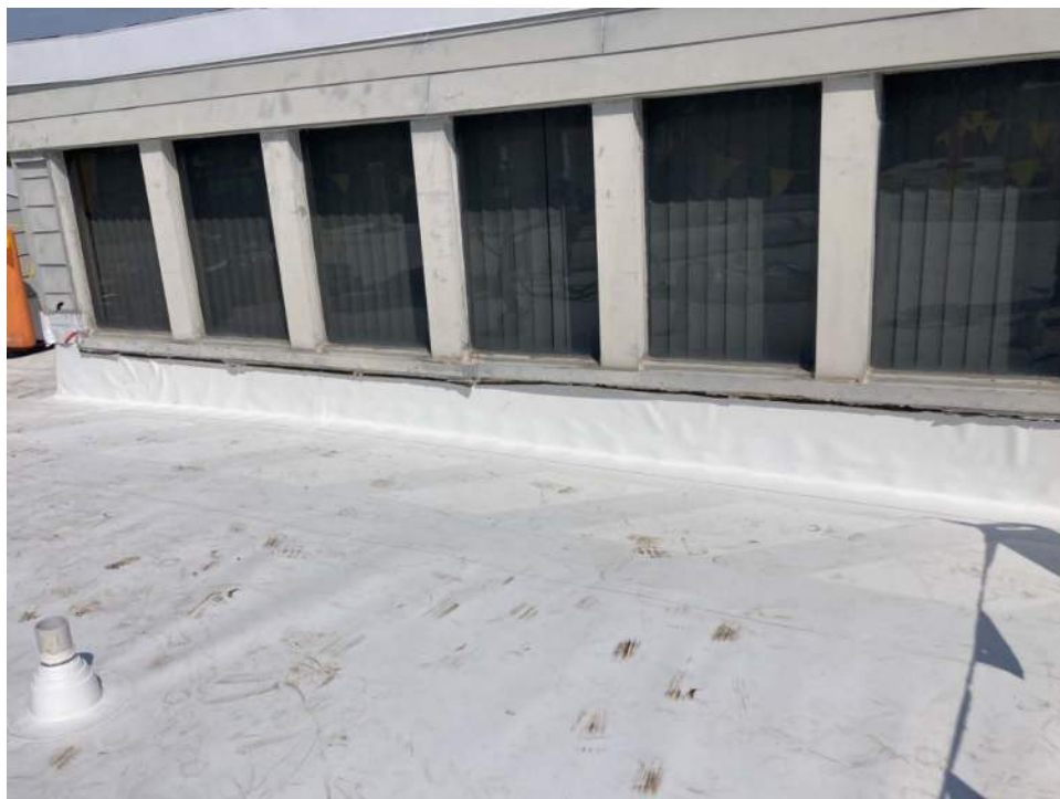
Figure 6: Windows