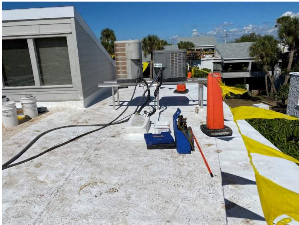
Figure 2 – TPO Roofing System