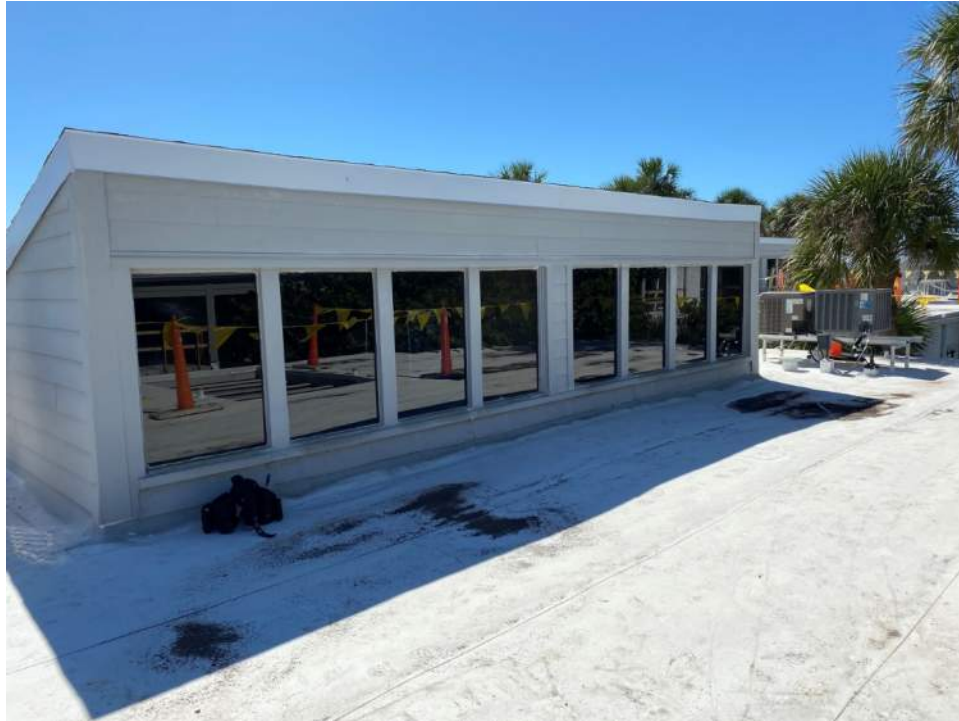
Figure 6: Windows