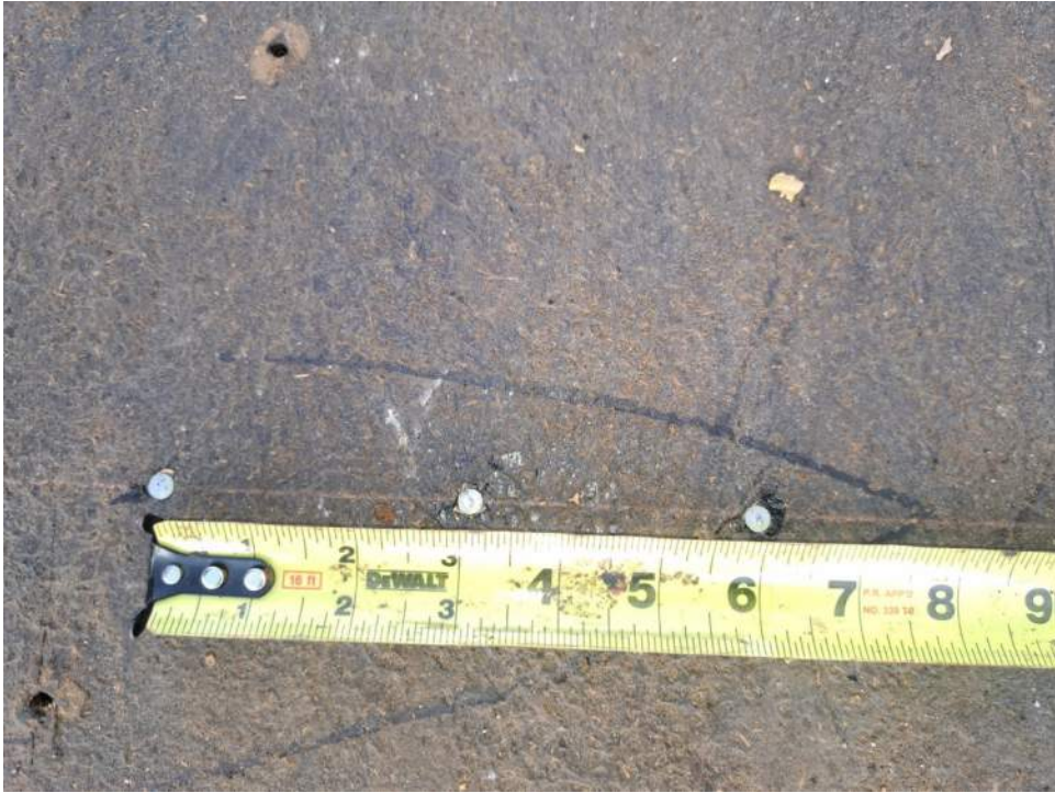
Figure 3 –Roof Deck Attachment – 8d common nails spaced max 6 inches