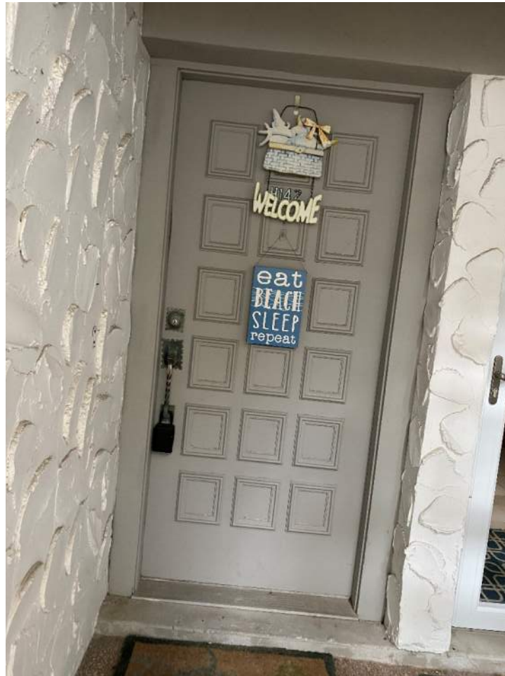
Figure 7: Entry Door