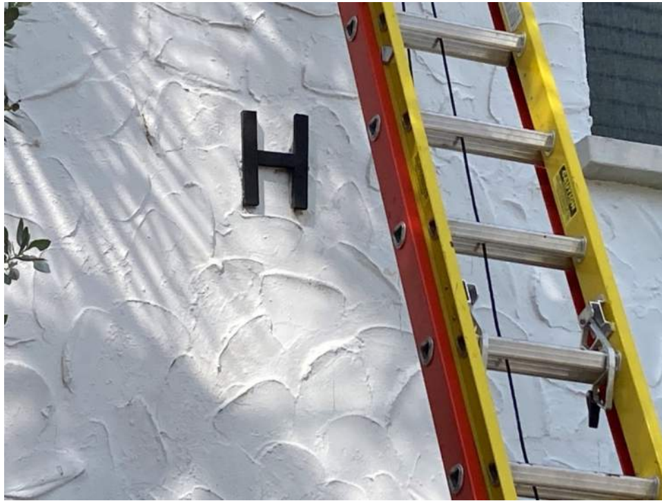
Figure 1 – Building H