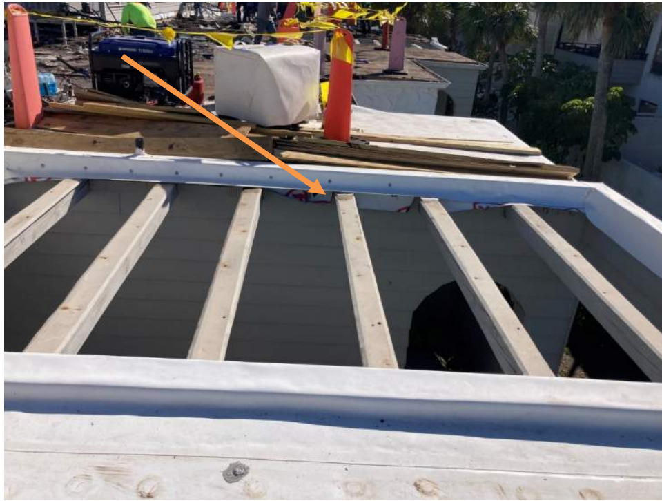
Figure 5 – Secondary Water Resistance - Yes