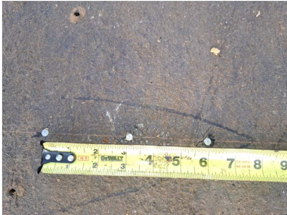
Figure 3 –Roof Deck Attachment – 8d common nails spaced max 6 inches