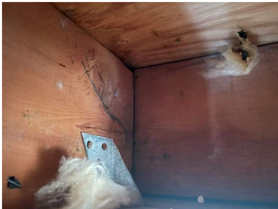
Figure 4 - Roof to Wall Attachment – Clips