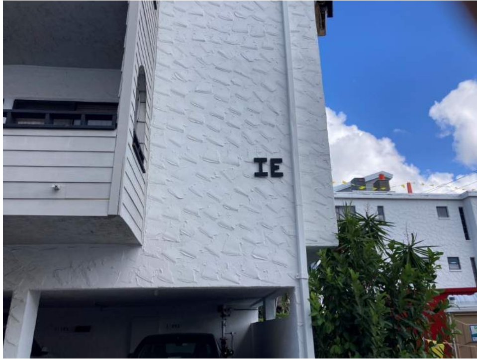
Figure 1 – Building IE