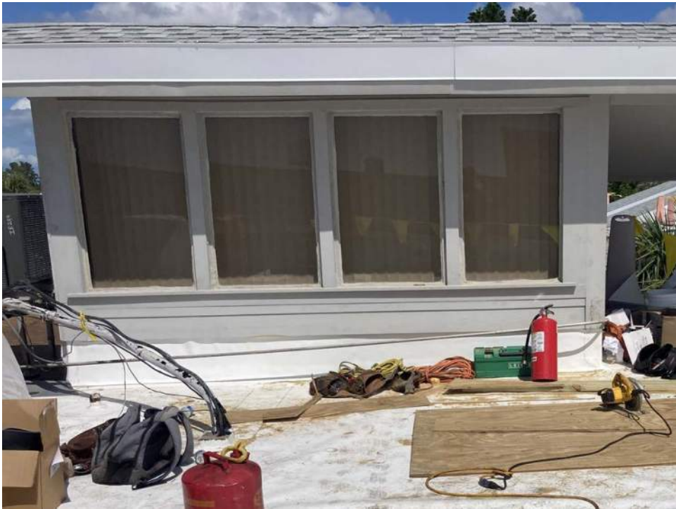
Figure 6: Windows