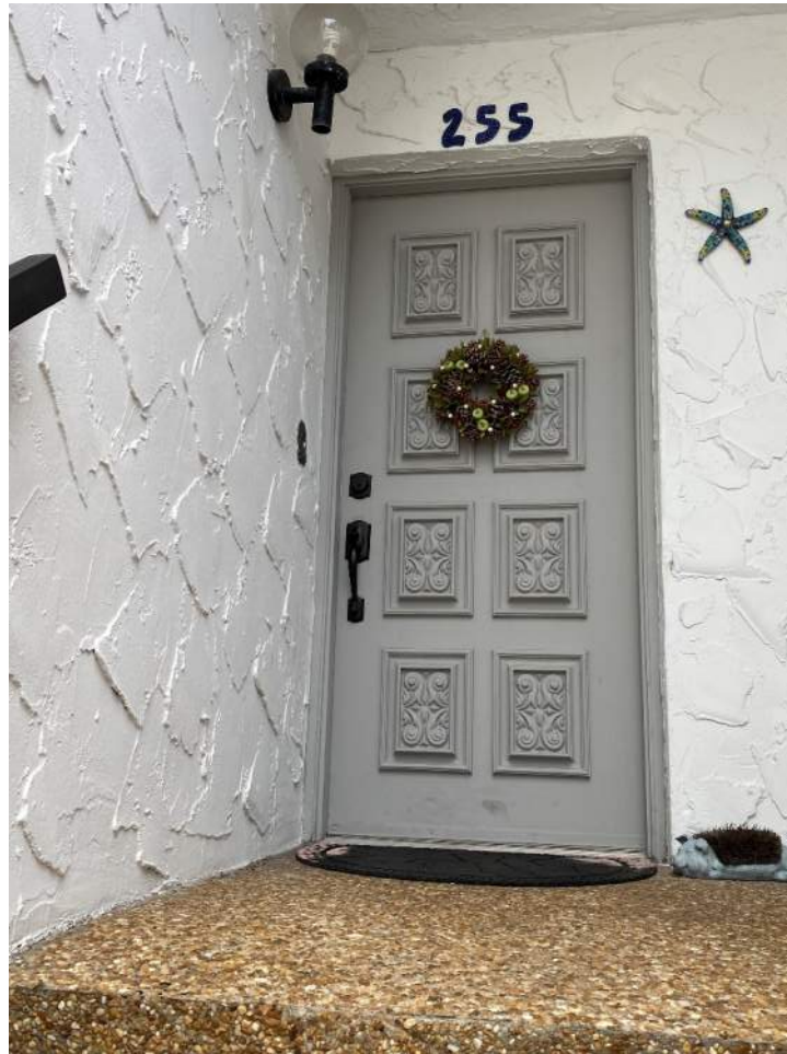
Figure 7: Entry Door