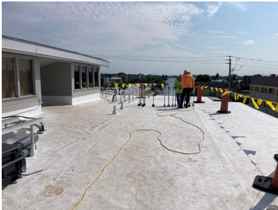
Figure 2 – TPO Roofing System