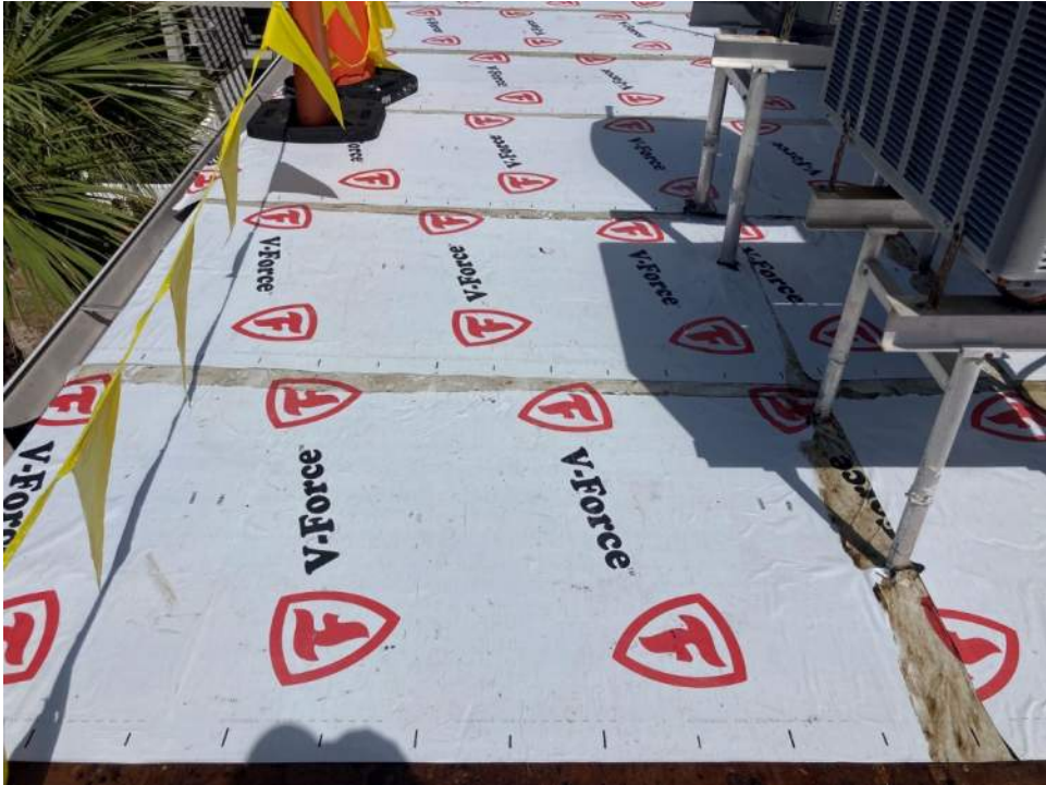
Figure 5 – Secondary Water Resistance - Yes