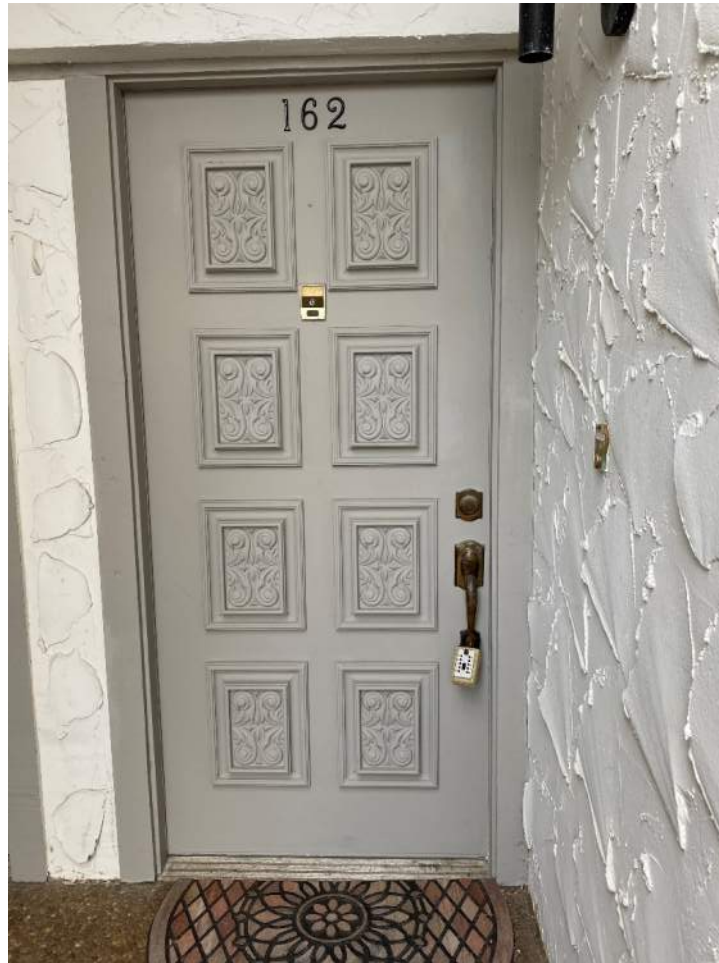
Figure 7: Entry Door