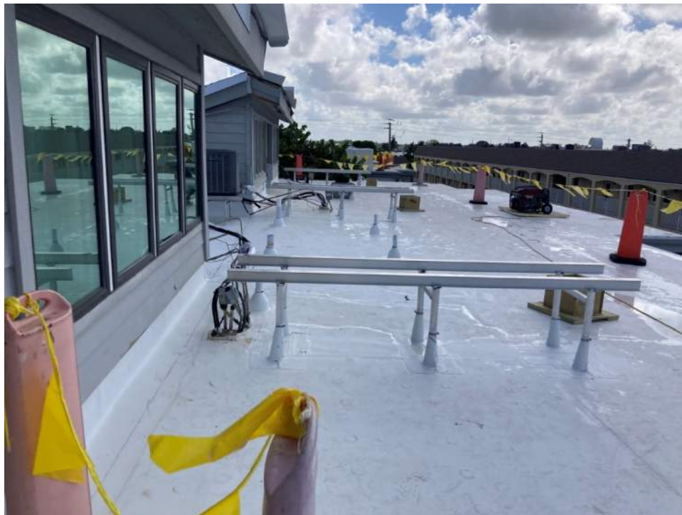
Figure 2 – TPO Roofing System