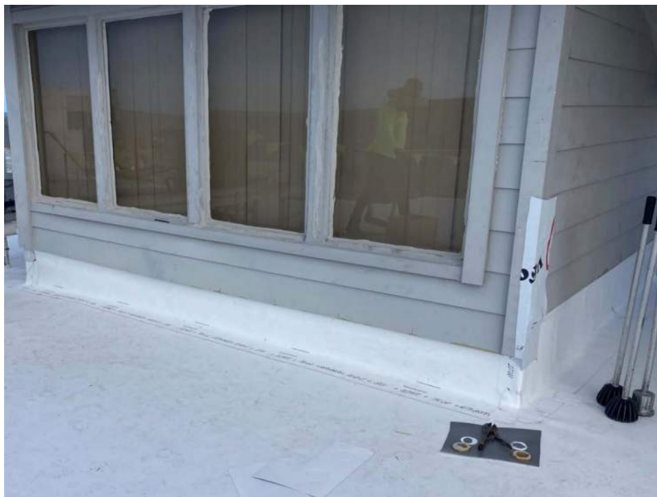
Figure 6: Windows