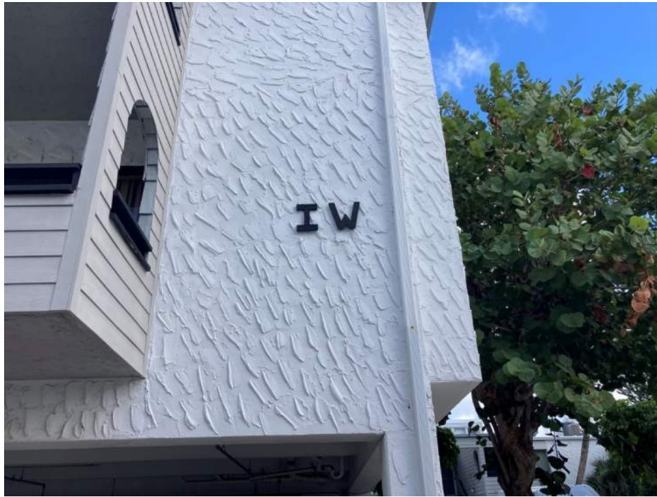
Figure 1 – Building IW