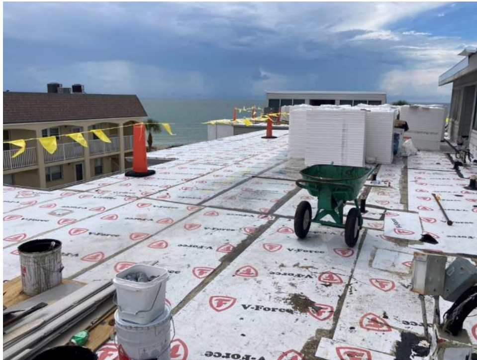
Figure 5 – Secondary Water Resistance - Yes