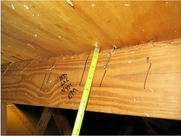
8d nails 6x6 Roof Deck Attachment