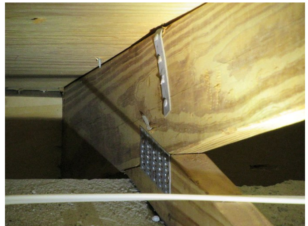
Single wrap Roof To Wall Attachment