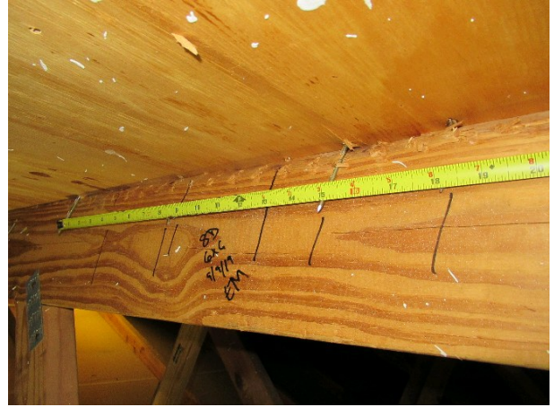
8d nails 6x6 Roof Deck Attachment