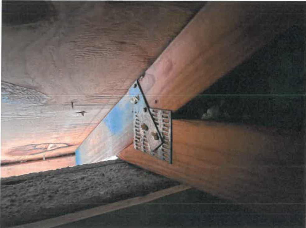
Figure 6 - Roof to Wall Attachment (Side 2)