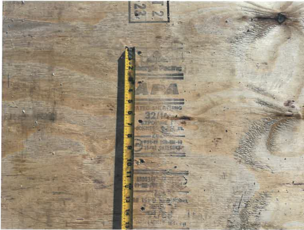
Figure 3 – Sheathing Fastener Field Spacing