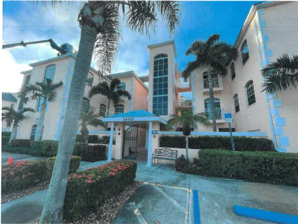
Figure 1: Roof Type (Composite) and Geometry (Hip)