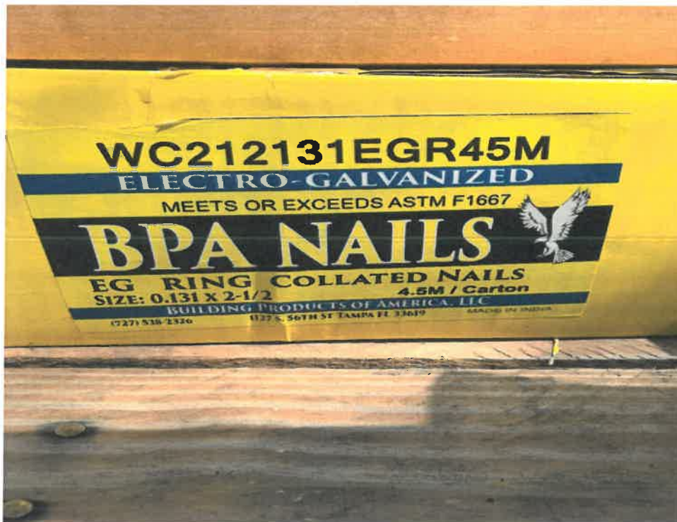
Figure 2 - Roof Deck Attachment