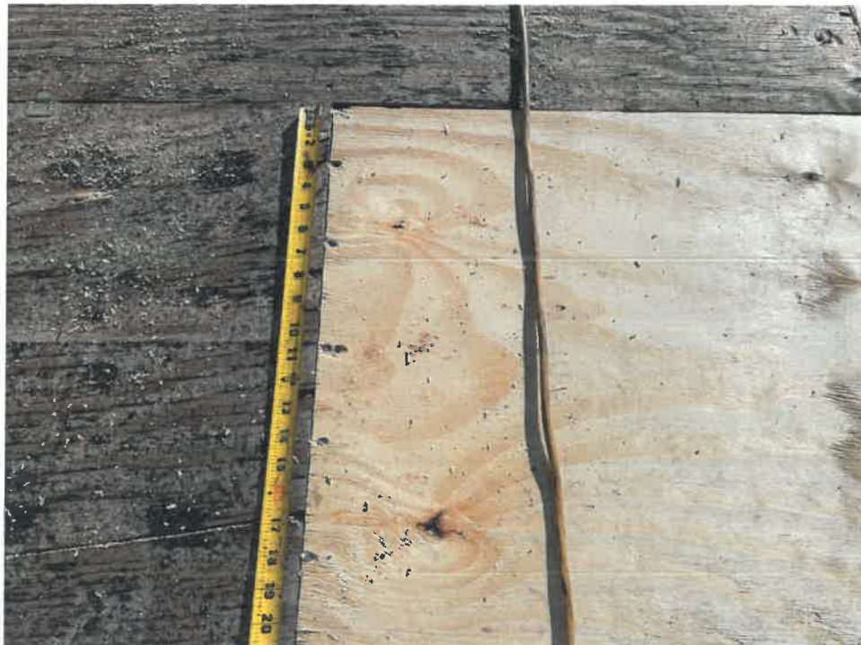
Figure 4 – Sheathing Edge Fastener Edge Spacing