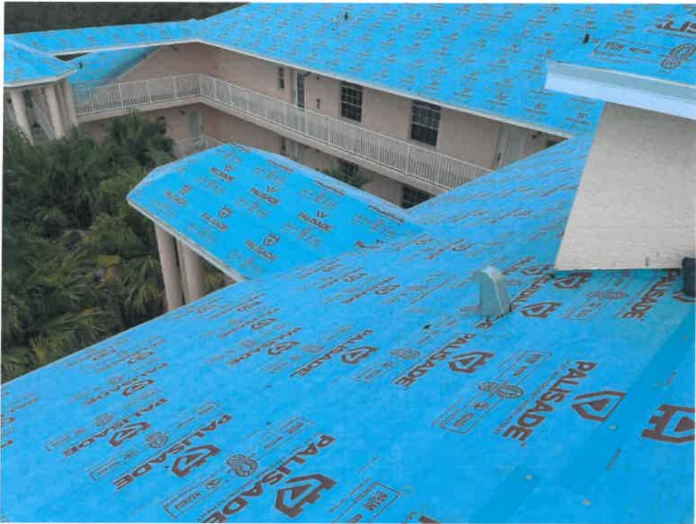
Figure 7 - Secondary Water Resistance