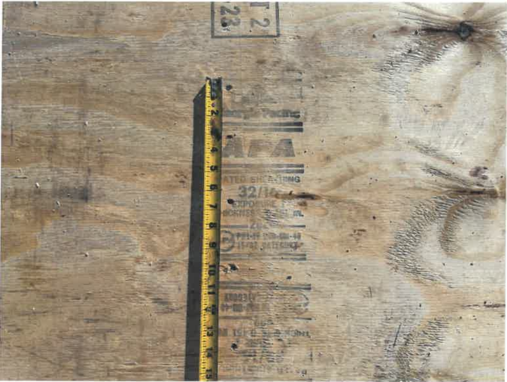
Figure 3 – Sheathing Fastener Field Spacing