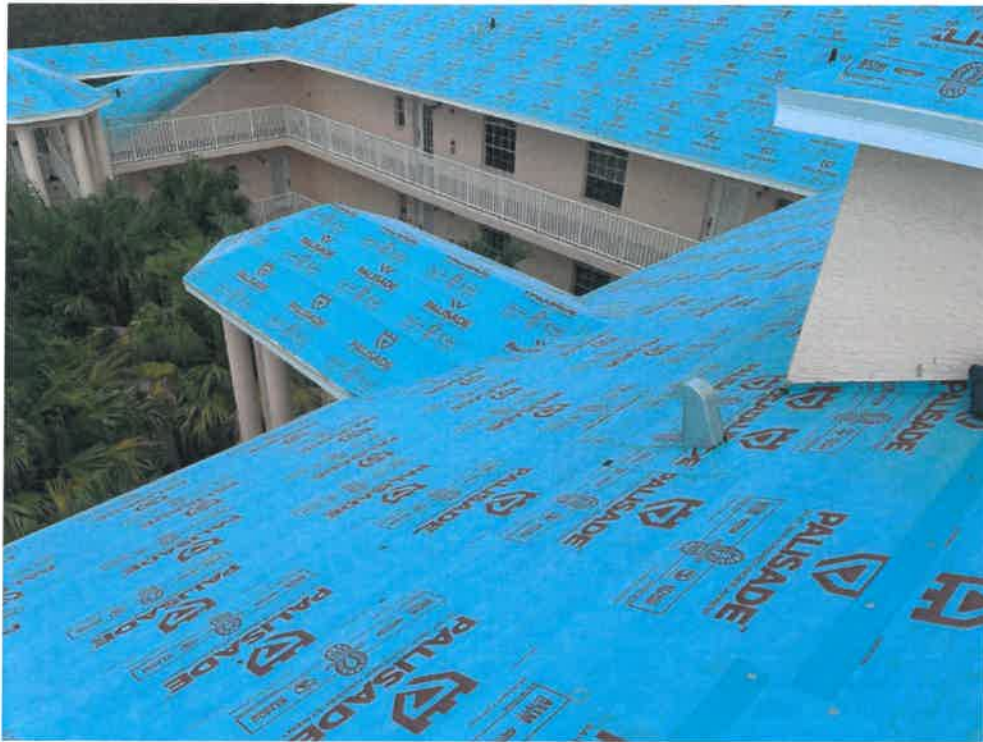
Figure 7 - Secondary Water Resistance