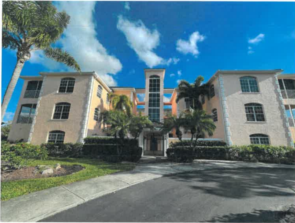
Figure 1: Roof Type (Composite) and Geometry (Hip)