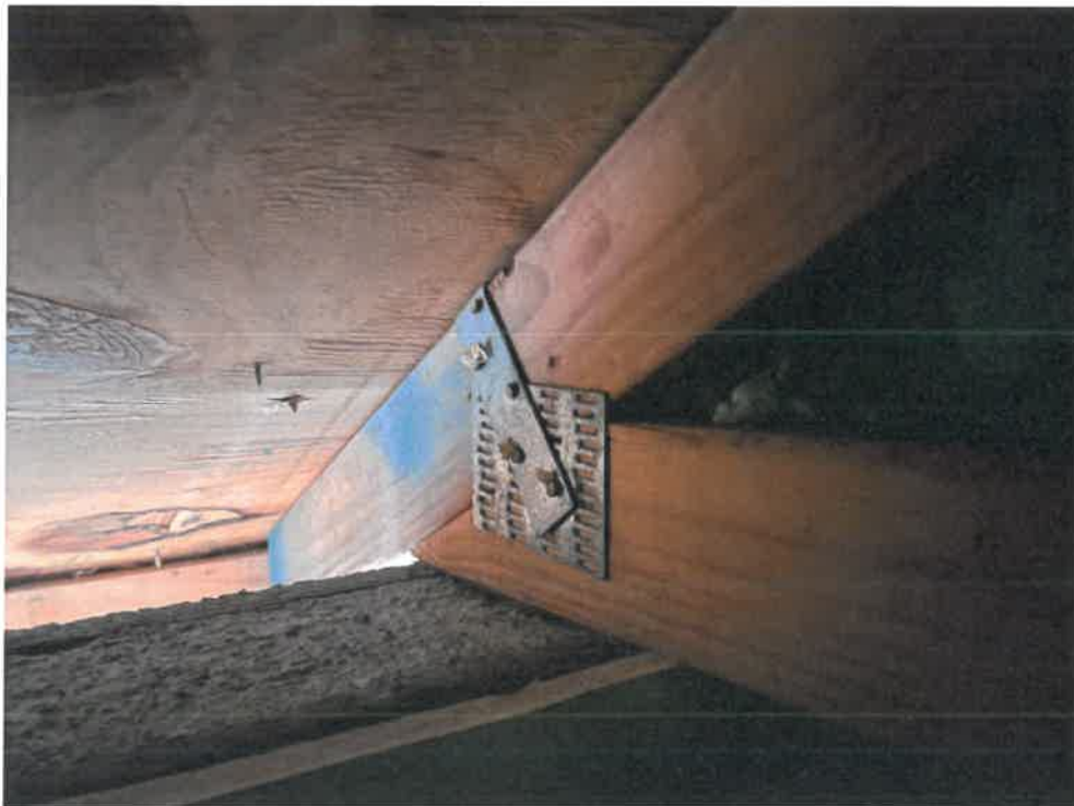
Figure 6 - Roof to Wall Attachment (Side 2)