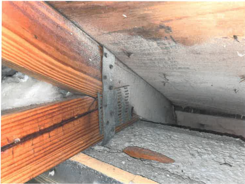
Figure 5 – Roof to Wall Attachment (Side 1)