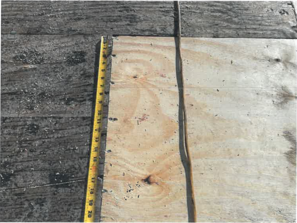
Figure 4 – Sheathing Edge Fastener Edge Spacing