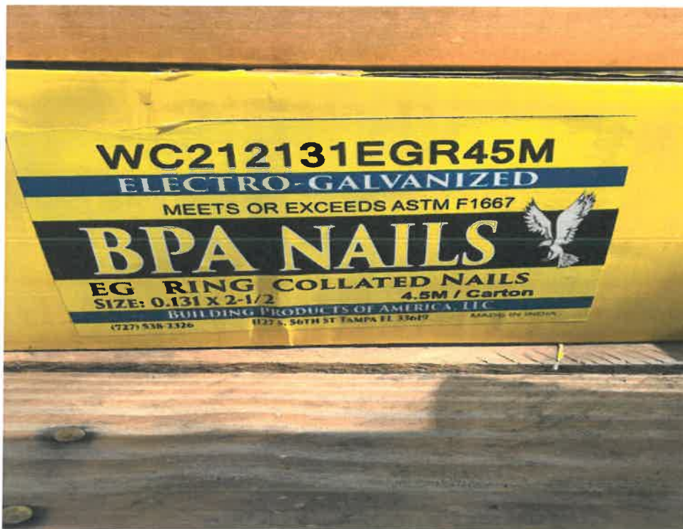
Figure 2 - Roof Deck Attachment