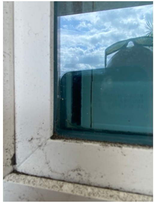
Etching on impact glass

Inspector Initials LO Property Address 950 Tarpon Center Dr., Venice, 34285