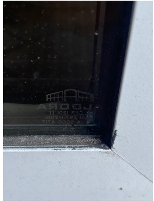
Etching on impact glass

Inspector Initials LO Property Address 950 Tarpon Center Dr., Venice, 34285