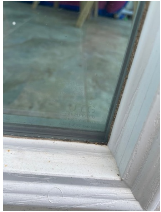
Etching on impact glass